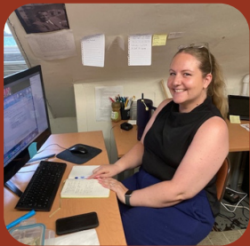
What's New at the Mansion