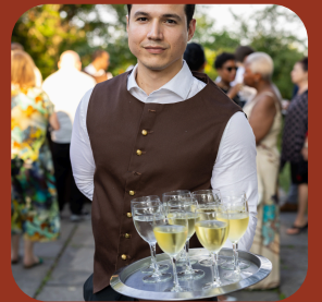
Spotlight On George Washington Dinner