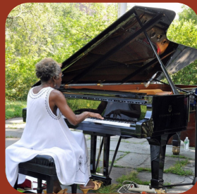
Jazz at the Mansion