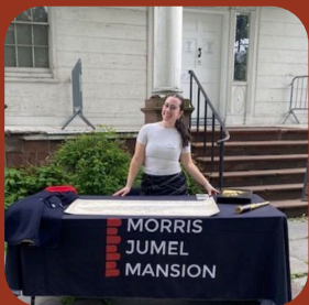
What's New at the Mansion