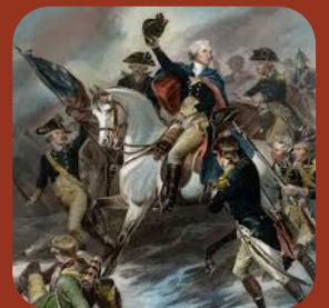
Spotlight On July 10th