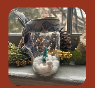
What's New at the Mansion